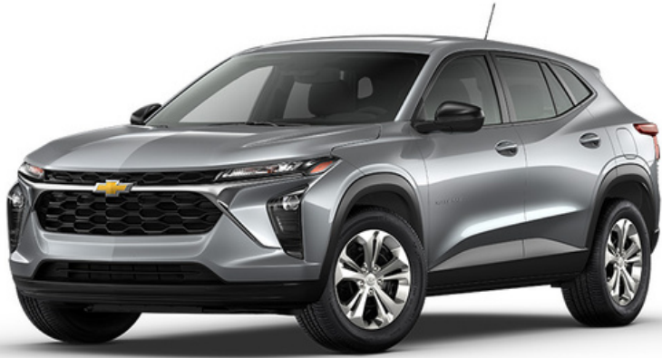
CHEVY TRAX LS GRAND ACHIEVER OR $425 PER MONTH.