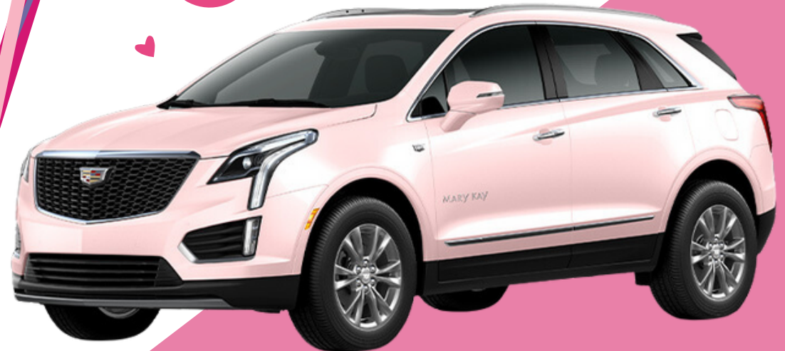
CADILLAC XT5 CADILLAC CLUB OR $900 PER MONTH