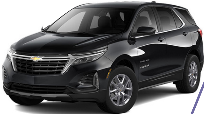
CHEVY EQUINOX PREMIER CLUB OR $500 PER MONTH